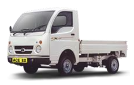
Figure 2: Tata Ace Ex

Tata Motors Limited (TML), a publically-listed company of the Tata Group and known for introducing the world's cheapest car, the "Tata Nano", has another successful frugal innovation to its credit, namely the mini truck "Tata Ace", which was launched in May 2005. The Tata Ace is a small commercial vehicle (SCV) with a payload capacity of 0.75 tons (TML, 2005). Launched for a price-tag of Rs. 225,000 (approx. $5,000) the Ace cost 50% less than any other four-wheeled commercial vehicle in India (Palepu and Srinivasan, 2008).