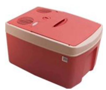
Figure 5: ChotuKool

refrigerators (Innosight, 2011). They only required limited storage (Whitney, 2010), which would save milk, vegetables and leftovers from spoilage for a day or two (Eyring et al. , 2011; Innosight, 2011). This purpose is well-served by ChotuKool that can keep foodstuff 20°C below outside temperature (Godrej, 2012). Additionally, the 30-litre variant seeks to target more prosperous customers in regions faced with power cuts as a backup cooling instrument