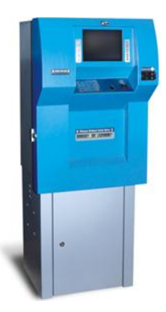
Figure 4: A Gramateller ATM

ATMs require about 1,800 units of electricity per month, a "Gramateller" of Vortex requires only 72 units (Shivapriya, 2010). While conventional ATMs work on temperatures around 35°C (Simhan, n.d.), the rugged ATMs of Vortex do not require air conditioning and are able to cope with temperatures ranging between 0°C and 50°C. This enables reduction in CO<sub>2</sub> emissions by at least 18,500 kg. per annum (IBEF, n.d.). The ATMs come equipped with in-built systems of uninterrupted power supply (UPS) and "bring down monthly electricity bills to less than Rs. 600" (approx. $12) (Vortex, 2012). The total cost of ownership for Vortex machines works out to be 50% less than for conventional ATMs (Mittal, 2012; Simhan, n.d.). Whilst conventional ATMs generally require fresh and crisp notes to function without hassles, Vortex's ATMs are reportedly the only