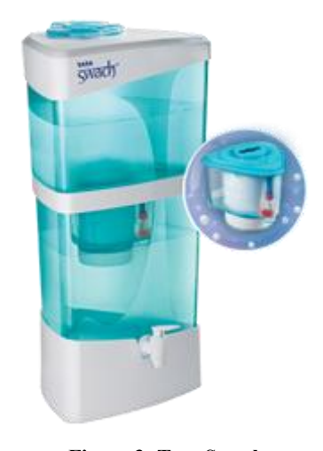
Figure 3: Tata Swach

Following closely on the heels of Tata Motors launching the world's cheapest car the Tata Nano, another Tata Group company, Tata Chemicals Ltd. (TCL) introduced the "Tata Swach" the world's cheapest household water purification system in December 2009 (Economic Times, 2009). The objective, declared in TCL's Annual Report for FY 2009-10, was "to reduce the incidence of water borne diseases by making safe drinking water accessible to all" (TCL, 2010: 9). The expression "Swach" is a variant of Hindi word "Swachchh" and means "clean". It has been developed by TCL's Innovation Centre and is based on "natural materials and cutting edge nanotechnology" (TCL, 2010: 9). While the combination of "locally sourced"